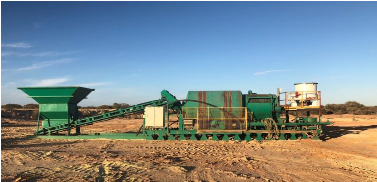
Photo 1: Equipment as arrived on site next to the historical Cosmopolitan Mine foundations and Dump 5.