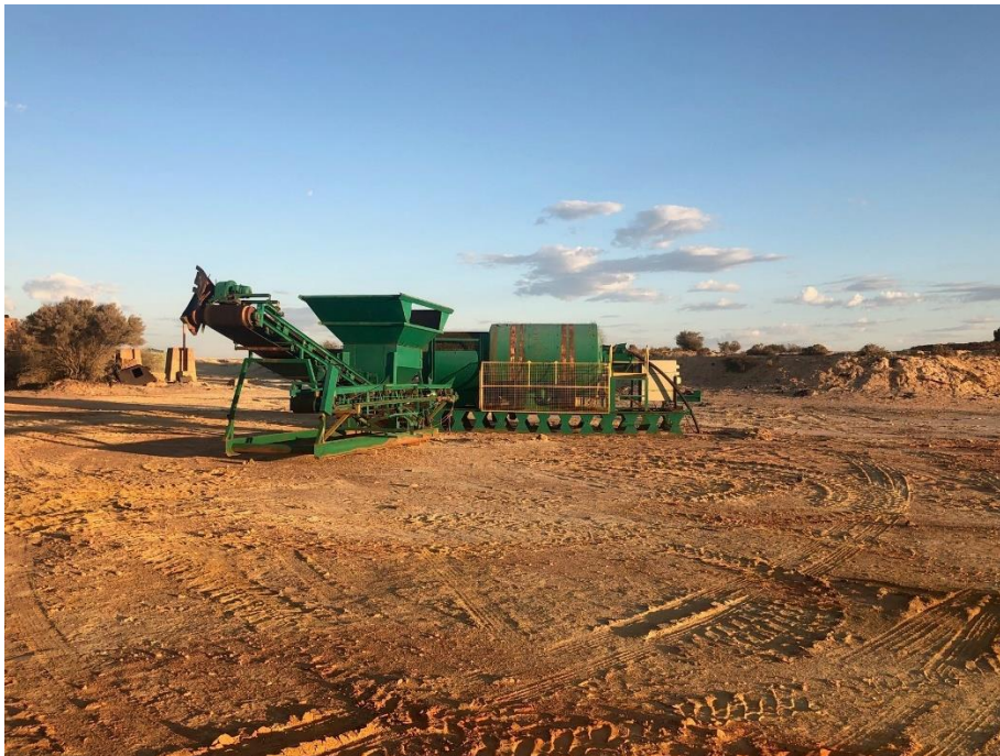
Photo 1: Equipment as arrived on site next to the historical Cosmopolitan Mine foundations and Dump 5.