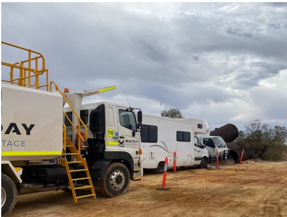
Photo 3: Staff Campervans and water truck next to the old boilers from the Cosmopolitan Mine.