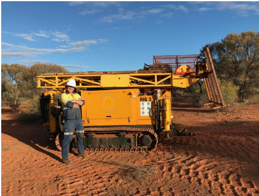
Figure 1 – A diamond core rig positioned to drill the DCC Trend.

Nex Metals Explorations Ltd (ASX: NME) (" NEX " or " Company ") is pleased to announce that our joint venture partner Metalicity Limited (ASX: MCT) has commenced drilling at the Kookynie Gold Project, located approximately 50km south of the WA Goldfields town of Leonora.