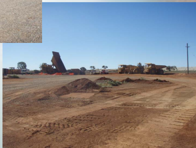
Rehabilitating previous areas of disturbance; mining fleet in the background at the ready