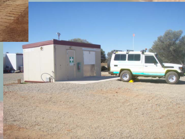
Continued Orient Well camp upgrades including medical facility and emergency response vehicle