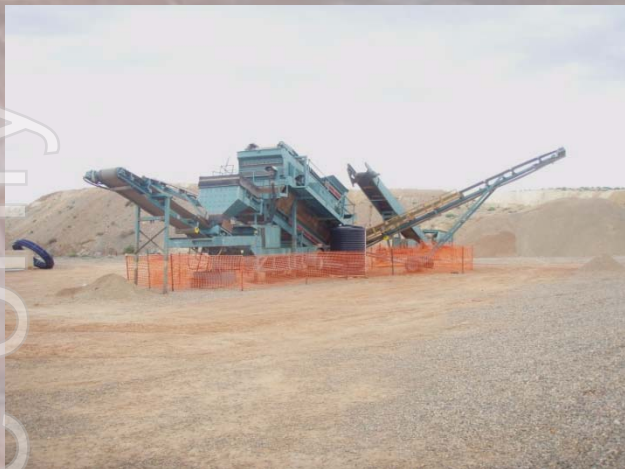
Mobile power screen unit processing local scats for various construction materials