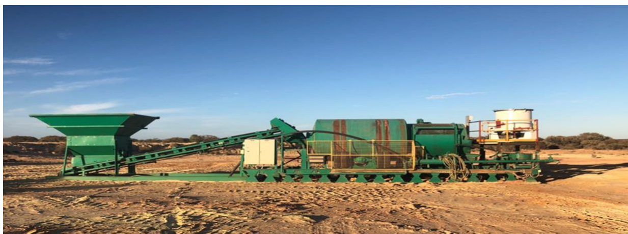
Photo 1: Equipment as arrived on site next to the historical Cosmopolitan Mine foundations and Dump 5.

During the period the Company commissioned a processing plant for the tailings processing trial at the Kookynie Tailings Research Project. Production commenced during the period to produce a concentrate. The concentrate will be reprocessed in Perth. The Company has now sourced additional processing capability which will near double the throughput and supplement the existing equipment. The equipment is being commissioned in Perth then delivered to site ready for operation on arrival. A new borehole has been drilled and cased, eliminating any water supply issues, with only a 37-metre depth but 20 metres of head there is sufficient long-term water supply now tapped for the complete tailings project.