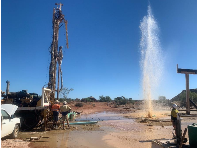
PHOTO 1: New bore drilled and cased 37 metres depth with 20 metres of head.